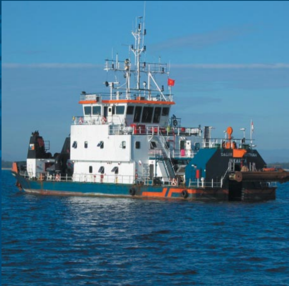
Water injection dredger Sagar Manthan